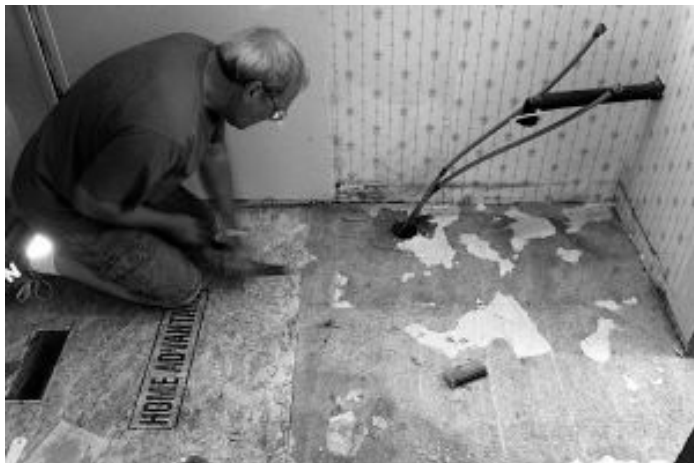
Habitat for Humanity Susquehanna relies on volunteers to help with certain repairs and projects. However, in the Repair Program, professional contractors perform the most common work such as roof replacements, window installation and furnace upgrades.